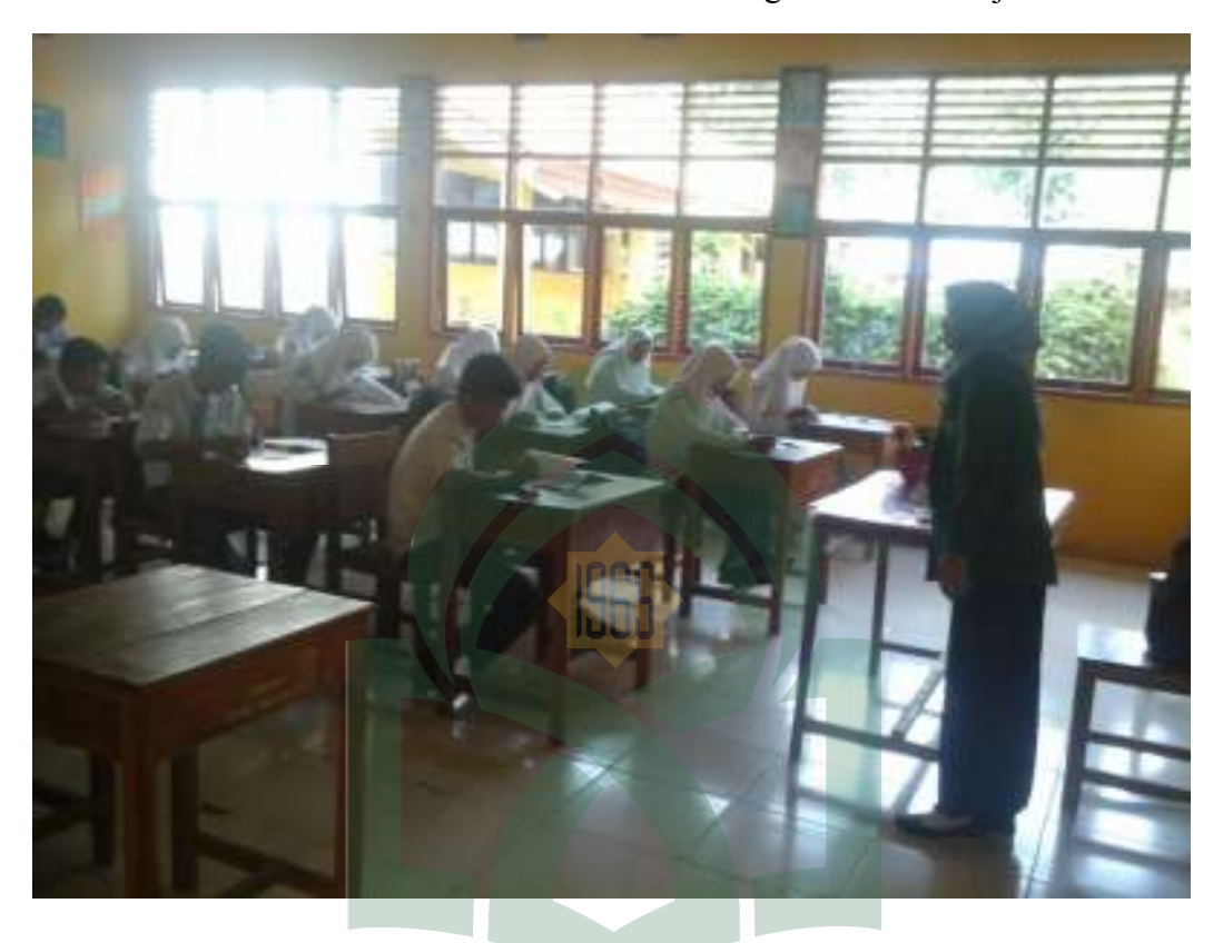
APPENDIX X Documentation of Research in SMA Negeri 3 South Sinjai