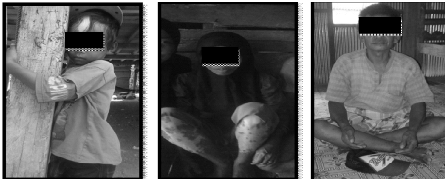
Figure 1: Ethnic of To Bentong, Tobalo, and To Kribo

Central public administration To Bentong ethnic in the village of Bulo-Bulo located in the Lappatammu hamlet, which in this village is also the public can access education elementary school and Senior High School. There is also the nearest health services namely community health clinic located in this village.