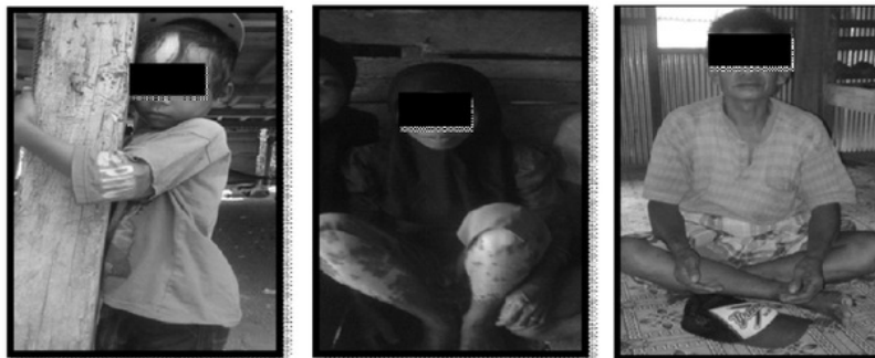
Figure 1: Ethnic of To Bentong, Tobalo, and To Kribo

Central public administration To Bentong ethnic in the village of Bulo-Bulo located in the Lappatemmu hamlet, which in this village is also the public can access education elementary school and Senior High School. There is also the nearest health services namely community health clinic located in this village.