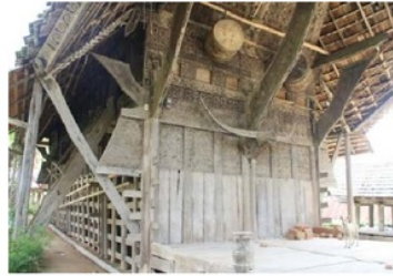
Fig. 6. Buffalo horn ornament in the front part of Banua Layuk

becomes the most sacred tree in Mamasa society and consider as the sacred place for worship to the Gods.