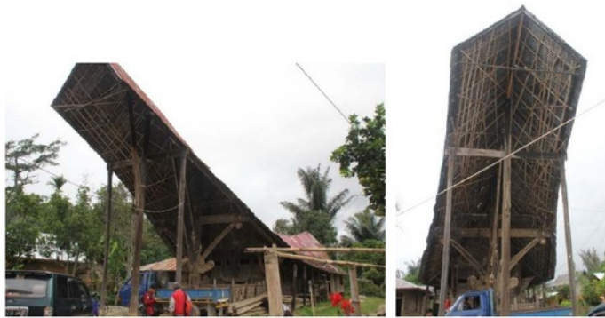
Fig. 1. Banua Layuk Mamasa

The word "banua" means house, "layuk" means height, and "banua layuk" means a stilt house or elevated house with big size and high. Most of the owner is the leader of a society or nobility. Banua Layuk (Figure 1) is a traditional house, bigger and higher than another Banua. Banua Layuk has five or six rooms and the resident is from Tana' Bulawan class. [5][6]