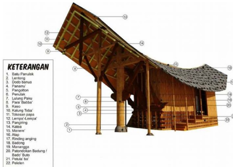
Fig. 2. Components of Banua Layuk Building Structure

Visual form in Mamasa traditional house presents a symbol of unity in harmony, vertically or horizontally. The visual form and description of architectural components in Banua Layuk Mamasa are as follows (figure 2):