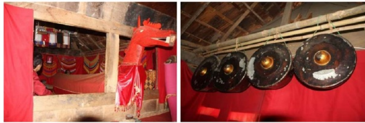
Fig. 3. Banua Layuk atmosphere

One-way circulation applied for all Banua (slightly similar), crossing Taming room is forbidden (the most sacred room inside the house). When someone enter the house from the front door, then the exit door must be the front door too. When someone enter the house from the front door then leaving from the back door or otherwise, Mamasa society believe the fortune would be passing by anyway and will not reside inside the house. For family or relative, they must be understood that they will enter from kitchen or lombon, the quest will enter from tado' in front door.