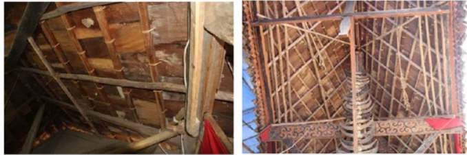
Fig. 4. Open Ceiling in Banua Layuk Roof Frame