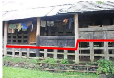
Fig. 7. Construction structure in Banua Layuk is in form of interlocking construction

Buffalo head or Tedong put in the front part of Banua Layuk, related to the Mamasa society opinion that buffalo has an important role in their daily life, besides as dominant cattle (figure 6). Buffalo is a symbol of stratification of a family, assigned as prosperity meaning. There are two buffaloes head in Banua Layuk, the male buffalo head in Penulak and female buffalo head in the house body (kale). Both of these buffalo heads are a symbol of couple, man and woman. The symbol meaning is creating a family should consist of a couple, a unity of man and woman. Man as the head of family contributes for its environment (society) and the woman manages the household. This interpretation presents in the positioning of the male buffalo head in front part and the female buffalo head is in back part of the house. According to hierarchy status in household, the head of the family has an important role, the family leader, thus the male buffalo head positioning is in front house.