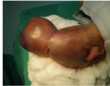
Figure 3. The preoperative view of the patients under general anesthesia

After the surgery, there were no evidence of infection and cerebrospinal fluid leakage. The wound healed perfectly, and there were no signs of raised intracranial pressure during hospitalization. She began breast feeding in a week after