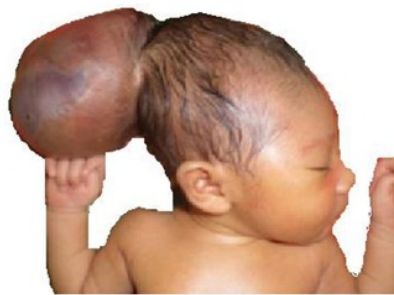
Figure 1. The occipital meningoencephalocele in a full-term neonate

with little erythema at the center, head circumference was 28 cm. The consistency of the swelling was soft with negative trans illumination test (Figure 1). The vital signs within normal limit, there was no sign of respiratory distress, normal bladder and bowel function.