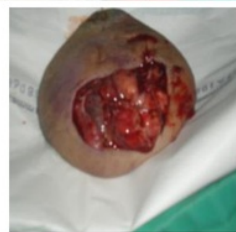
Figure 4. The excision of extra cranial tissue, and the sack containing non-functional brain tissue after removal

Two weeks after surgery, the patient was discharge. The head circumference increased 2 cm, but it was still considered as microcephaly. The