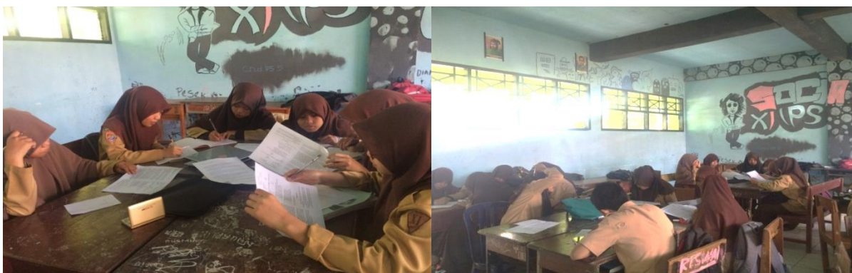
Picture 5. The students were doing achievement test of the second cycle

In the third meeting, the atmosphere of the class was really different because the students were crowded in joining the games. The students were really enthusiastic and enjoy the competition. It made the researcher happy because it was a little improvement of the students in comprehending the text. It was proved with their comprehension in predicting the text. In the fourth meeting on 28 th April 2016, the researcher gave the students achievement test (see the pictures below) to know the improvement of the students' reading comprehension during the second cycle. The achievement test consisted of 10 items of multiple choices in form of narrative text. After calculating the score, the researcher found the mean score of the achievement test in the second cycle was 81.61%. The students' score showed the improvement than in the first cycle (70.32%).