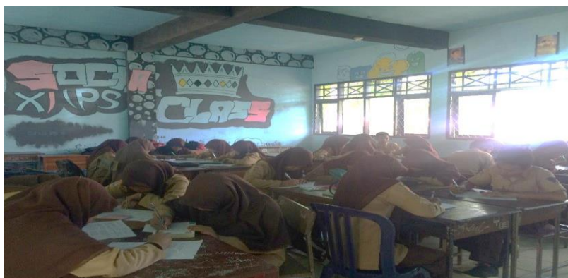
Picture 6. The students were enthusiasm in attending the class

Based on the observational sheet in the first cycle (see Appendix.VI), the researcher was glad to see the students' attendance. They were really enthusiasm in attending the class even they still had difficult in comprehending the material (see the pictures below). Even though some points had improved but, they still needed to be improved in the next cycle.