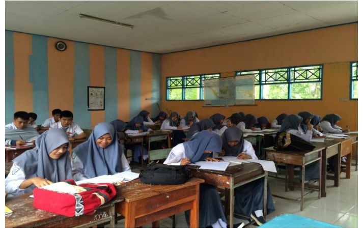
Achievement Test Cycle 1