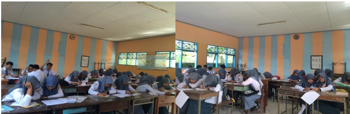
Picture 1. The students were doing the preliminary test

conducting the research. Before conducting the action, the students were given the preliminary test (see the pictures below) to measure the student prior knowledge in comprehending the text. The preliminary test consisted of 10 items of multiple choices in form of narrative text.