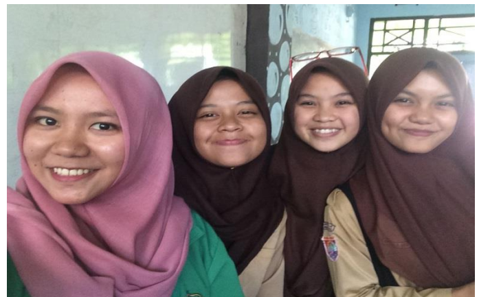
The Second Grade of Senior High School 1 Anggeraja