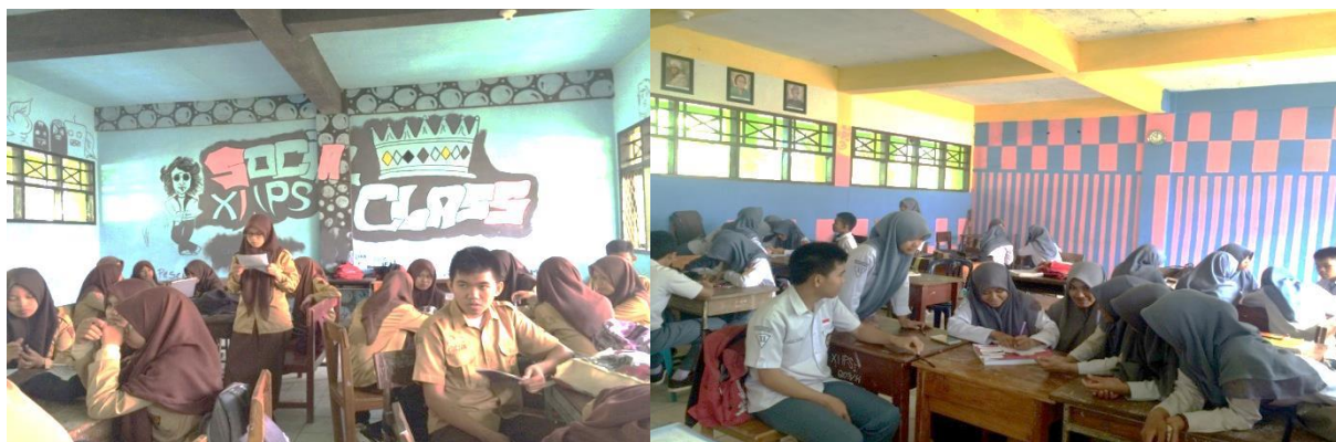
Picture 7. The students showed their activeness in learning process

In the other side, the observational sheet of the students' activity towards tea party strategy in the second cycle (see Appendix. X) was better than the previous observation. The mean score of the observation was up to 3.6%. Most of the students showed their activeness in learning process (see the poughtures below). It can be seen that the students were not ashamed in asking or clarifying their understanding of the test, sharing and discussing the test as well as comprehending the text well.