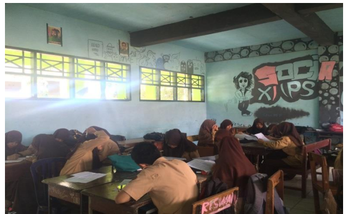
Achievement Test Cycle 2