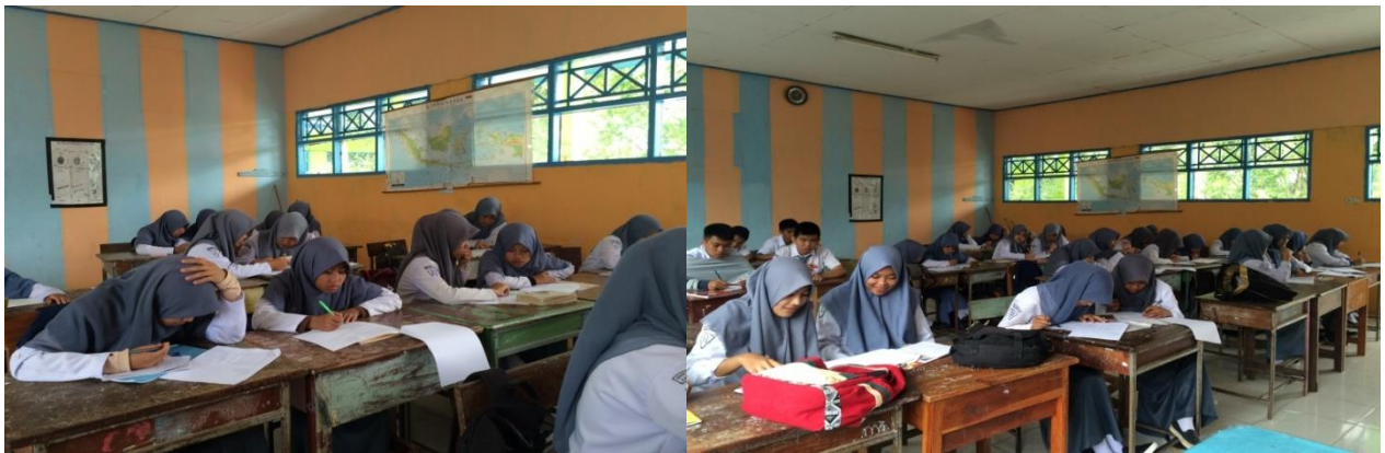
Picture 3. The students were doing achievement test of the first cycle

pictures below) to measure the students' achievement during the first cycle. The achievement test consisted of 10 items of multiple choices in form of narrative text.