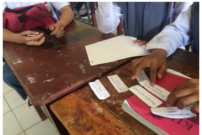
Tea Party Strategy as a Pre-Reading Activity