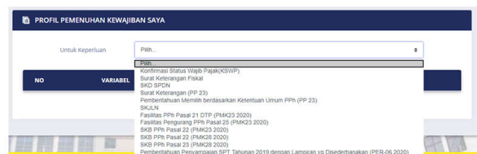
Figure 3 Options of tax facilities in My Obligation Compliance Profile