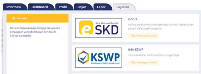
Figure 2 KSWP info in service menu