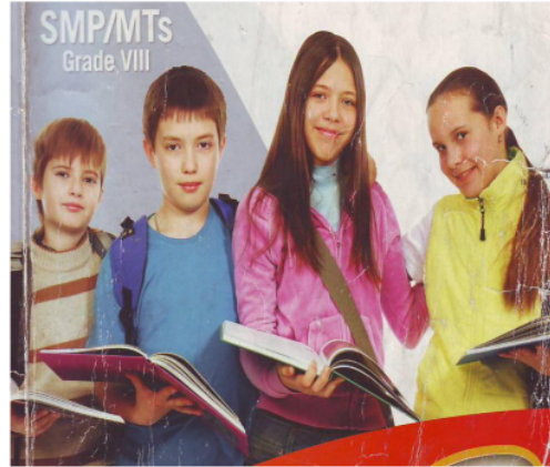
Fig. 1. Gender portrayal of the book cover

The teacher of grade VIII also identified the equal gender representation starting from the cover of the textbook used. She appreciated that the number of male and female were balance. She also identified the gender roles in that picture as equal. She said that all people (males and females) in that picture hold books. All of them focused their attention in one object, and they were smile and hold each other's shoulder. This teacher perceived this picture as the most ideal of gender equality.