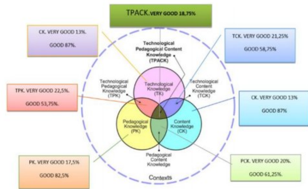
Figure 1 TPACK capability of madrasah teachers.

and Technological Pedagogical and Content Knowledge (TPACK) is as follows: