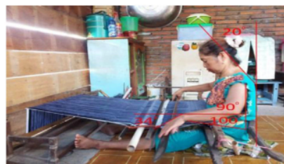
Fig. 3. The Manette process.

The process of Manette or weaving employing a parewa sign that has been made up of generation to generation by the Mandar individuals. This method is that the final method of constructing Lipa'Sa'be Mandar, with the respondent's position adjusting to the work instrumentality and therefore the object he's engaged on staff area unit usually in awkward postures like bending over, trying down, and sitting for terribly long.