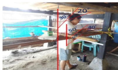
Fig. 1. Sumau process.

In order to manage the threads employed in the sumau method, respondents sometimes use an outsized space below the house as a method of constructing sautan. The sautan stage is typically created between the pillars below the house fabricated from gamo ( rumbia leaf midrib ). At the time of this sumau method, the staff sleep with in an exceedingly standing position, slightly bending and bending to regulate the body position to the position or location of the work object.