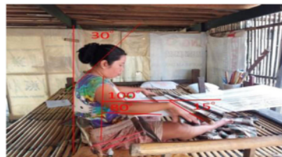
Fig. 2. The Mappatama process.

The mappatama method or inserting the thread into the sign, 1st the thread operate is checked before doing this method, and straightaway performs the association if there's a broken thread within the Mappatama method, the position of the respondent should match the work instrumentality and therefore the object being worked on. Therefore, respondents usually have awkward postures like bending, trying down and sitting for terribly long.