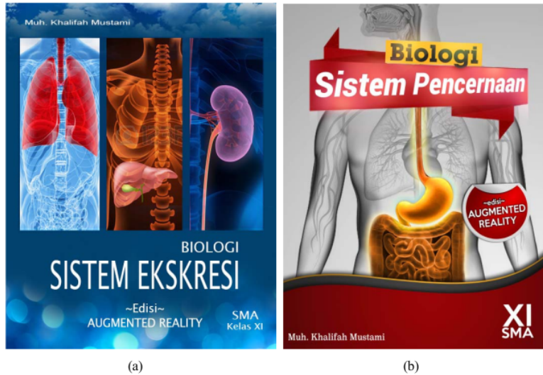
Figure 3 The illustration of biology textbooks integrated with augmented reality on the concept of (a) excretion system and (b) digestive system