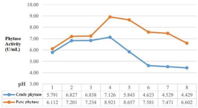
Fig. 1. Phytase activity of Burkholderia sp. strain HF.7 at various pH