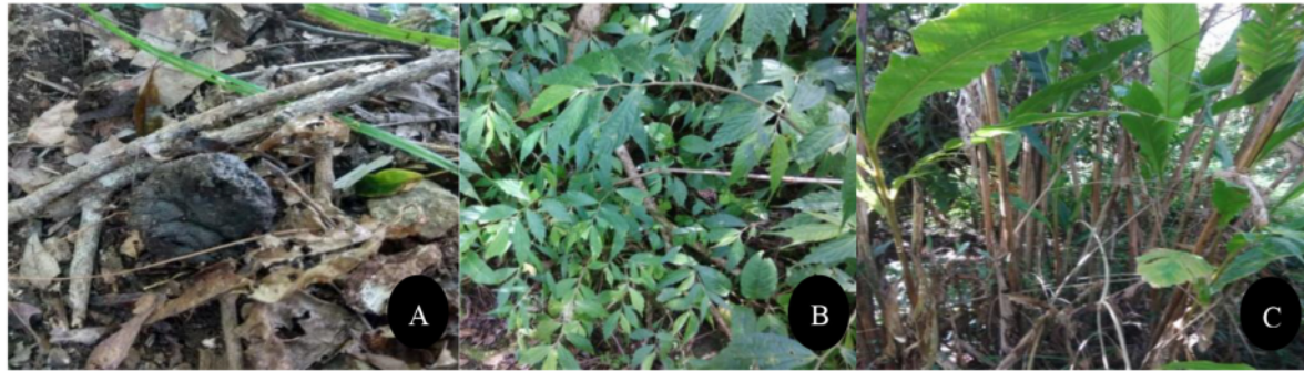
Fig. 2. The traces of Anoa ( Bubalus spp.), A. Feces, B. Ripped leaves are shown in Elatostema integrifolium (D. Don) Wedd., C. Ripped/torn leaves are shown in Alpinia sp.