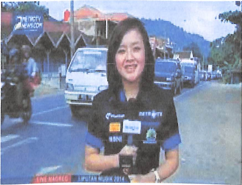
(Gambar Reporter Berita, Accessed October 17, 2021)

In part 2, we will learn about the principles and behaviours of reporting news, examples of texts for news reporter and exercise.