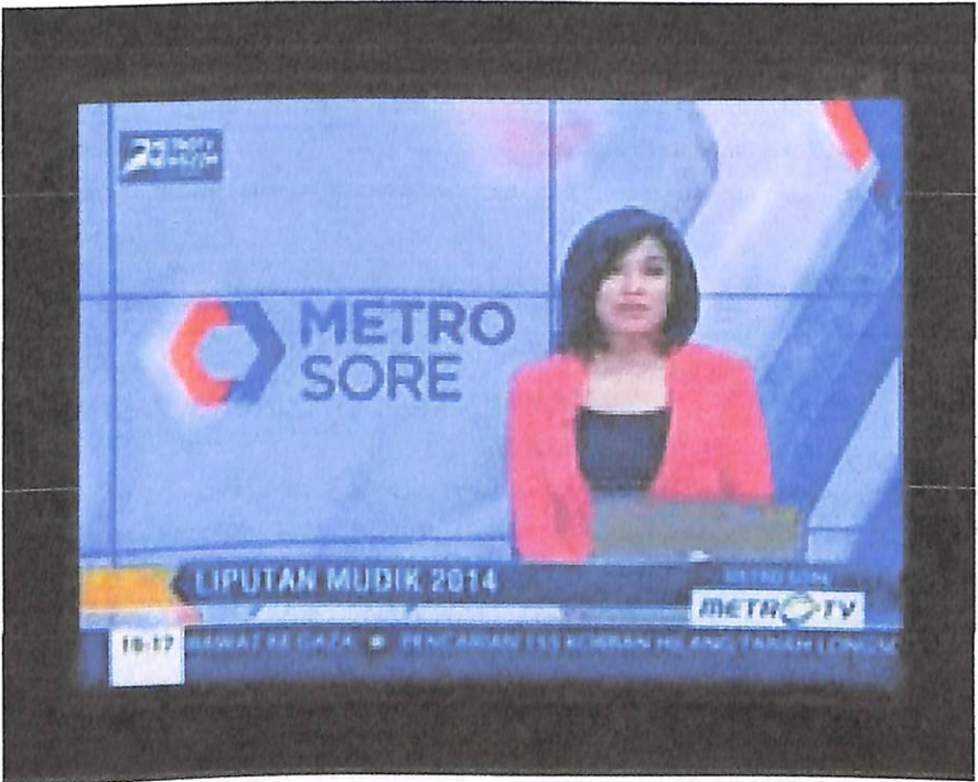
(Gambar Reporter Berita, Accessed October 17, 2021)

In part 3, we will learn about the principles of presenting news, examples of texts for news presenter and exercise.