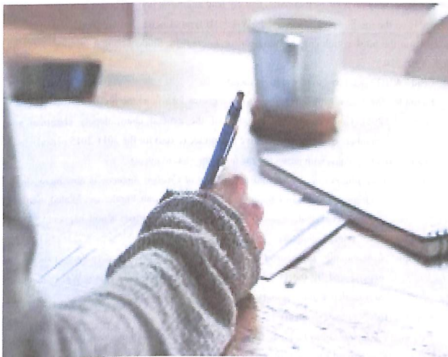
(Gambar Penulis Naskah Berita, Accessed October 17, 2021)

In part 1, we will learn about the structure of news text, the characteristics or conditions of news text and the structure, language style and ways for writing news text.