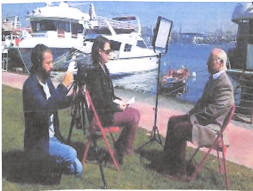
(Gambar Wawancara antara Jurnalis dan Narasumber, Accessed October 18, 2021)

Interview can be described in terms of individuals directing their attention towards each other with the purpose of opening up the possibility of gaining an insight into the experiences, concerns, interests, beliefs, values, knowledge and ways of seeing, thinking and acting of the other.