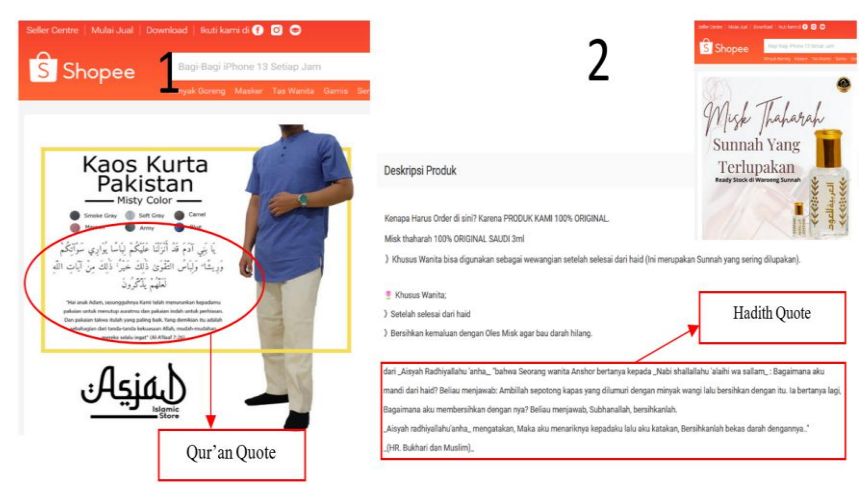
Figure 4. Thumbnails and Product Description

Figure 4 shows the Qur'an and Hadith excerpts inserted by merchants in their thumbnails and product descriptions. This allows sellers to explain that their products are legal in Islamic teachings. The Arabic Qur'an verse quotations accompanied by their translations (QS al-A'rāf/7:26) are seen in the thumbnail section. The Hadith quotes only display their translation in Indonesian, appearing in the product description section. This shows the popularity of the discourse on Islamic branding production at Shopee among the Muslim merchants.