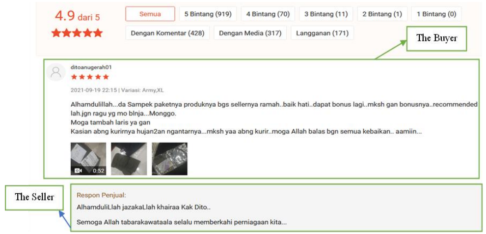
Figure 5. Buyer Response

an average of five stars on each product, meaning consumers were satisfied with the quality of the merchant's products and services. However, some consumers complain about product quality, as seen from the following image excerpt.