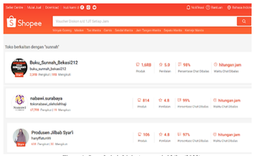
Figure 1. Store Label: Link, (accessed, 02/Jan/2022)

The data in table 1 shows that the label of Sunnah is the most utilized term (34.4%) that appears on Shopee from a total of 1600 products that use Islamic branding. Merchants combine these labels with those for product types, store locations, and other Arabic tags associated with Islamism symbols, as in Figures 2 and 3. The Sunnah labels with product types include Sunnah Book Store , Herbal Sunnah Shop , Sunnah Kurma , and Sunnah Qutfit . Examples of labels with names of store locations are Sunnah Store Solo , Sunnahjogja , Sunnah Store Bandung , Galeri Sunnah Makassar , Sunnahstore Balikpapan , Gamis Sunnah Purwokerto , and Pustaka Sunnah Gorontalo . The labels using other Islamic dictions include Yuk Hijrah Ke Sunnah , Lapak Dakwah Sunnah , Sunnah Rasulullah Store , Khalifa Sunnah , and Toko Sunnah Berkah . Sellers use the dictions in Arabic as Islamic branding offered at Shopee. Additionally, the Nabawī , Syar'ī , Halāl , Islāmī , and Da'wa dictions are found on the platform. Examples include Nabawī Herbal Official , Produsen Jilbab Syar'i , Halal Korean Food , Lapak Islami , and Akhir Zaman Muslim Store . Nevertheless, the Sunnah diction as a store label on Shopee is still widely used by sellers.