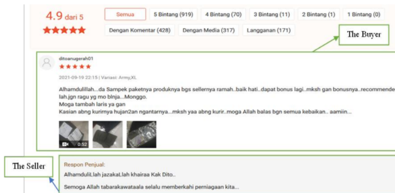
Figure 5. Buyer Response

an average of five stars on each product, meaning consumers were satisfied with the quality of the merchant's products and services. However, some consumers complain about product quality, as seen from the following image excerpt.