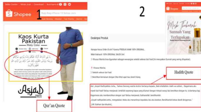
Figure 4. Thumbnails and Product Description

Figure 4 shows the Qur'an and Hadith excerpts inserted by merchants in their thumbnails and product descriptions. This allows sellers to explain that their products are legal in Islamic teachings. The Arabic Qur'an verse quotations accompanied by their translations (QS al-A'rāf/7:26) are seen in the thumbnail section. The Hadith quotes only display their translation in Indonesian, appearing in the product description section. This shows the popularity of the discourse on Islamic branding production at Shopee among the Muslim merchants.