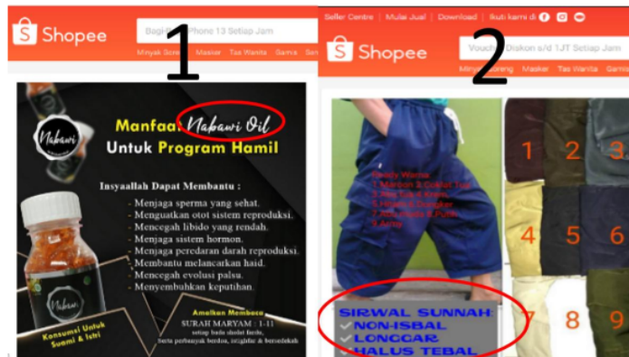
Figure 2. Sunnah and Nabawi Presentation

The data in table 1 shows that the label of Sunnah is the most utilized term (34.4%) that appears on Shopee from a total of 1600 products that use Islamic branding. Merchants combine these labels with those for product types, store locations, and other Arabic tags associated with Islamism symbols, as in Figures 2 and 3. The Sunnah labels with product types include Sunnah Book Store , Herbal Sunnah Shop , Sunnah Kurma , and Sunnah Outfit . Examples of labels with names of store locations are Sunnah Store Solo , Sunnahjogja , Sunnah Store Bandung , Galeri Sunnah Makassar , Sunnahstore Balikpapan , Gamis Sunnah Purwokerto , and Pustaka Sunnah Gorontalo . The labels using other Islamic dictions include Yuk Hijrah Ke Sunnah , Lapak Dakwah Sunnah , Sunnah Rasulullah Store , Khalifa Sunnah , and Toko Sunnah Berkah . Sellers use the dictions in Arabic as Islamic branding offered at Shopee. Additionally, the Nabawi , Syar'i , Halal , Islami , and Da'wa dictions are found on the platform. Examples include Nabawi Herbal Official , Produsen Jilbab Syar'i , Halal Korean Food , Lapak Islami , and Akhir Zaman Muslim Store . Nevertheless, the Sunnah diction as a store label on Shopee is still widely used by sellers.