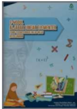
Figure 1. e-Module Cover