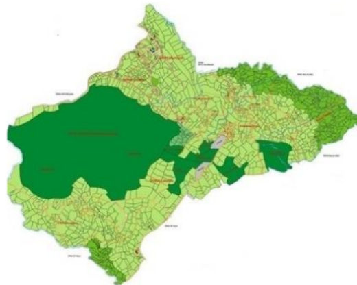
Figure 2. Territorial Area of the Kajang Tribe

Formally, the Kajang people are Muslims and Hindus. But in their daily spiritual practice, they believe in the religion of their ancestors; patuntung . For the Kajang people, the norms taught by their ancestors are more important than their formal religion, and the main values taught are recognition of the Almighty God (Tau Rie' a'ra'na; something that cannot be described), recognition of the old land (Tana Toa), and submission to the tribal leader (Ammatoa). Religious norms in the Kajang community are taught from generation to generation through oral tradition. What is taught in the ancestral religion is simplicity and peace (Tallasa Kamase-Mase) that will lead to a meeting with God. The symbol of simplicity and peace in the Kajang community is the color black. Everyone dresses in black, with more or less the same style and model. Including the Ammatoa wearing the same clothes as the community. Community houses are also built uniformly, from natural materials of the Kajang forest, and built together by community members. There is almost no competition within the community, and it flows naturally under the 'guidance' of Pasang Ri Kajang. The tasks and functions that distinguish them, and the differences between them in the community are to support each other's lives without exploitation. Togetherness and mutual cooperation are the indigenous traits of the archipelago based on the tradition of ancestral values (Sabri and Salahuddin 2022).