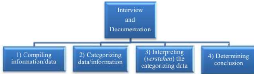
Table 1. Colaizzi's Analysis Method

The data was analysed using Colaizzi's 9 phases of analysis, which included compiling information / data, creating categories of data / information, interpreting the data / information that had been categorized, and determining the essence or structure of the data / information that had been categorized. Table 1 showed a brief summary of Colaizzi's analysis, as follow: