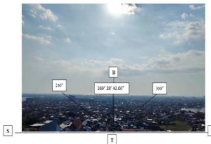
Figure 3 Feasibility of the Dawn Tower Iqra' area of Unismuh Makassar

As for the position of the Iqra' Tower, it is ideal, on the horizon with the view on the horizon undisturbed by buildings so that the horizon will be looked straight with the moon's azimuth of 269° 28' 42.06" which is in the south when the sun sets. 19