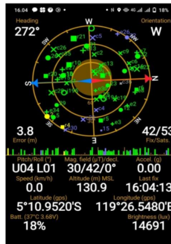
Figure 5 The height of the Ira' Tower seen from the GPS Status Application

Iqra' Tower Universitas Muhammadiyah Makassar with a height of 130.9 m. as shown below.