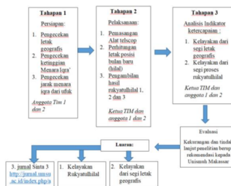
Figure 1. The research stages

The research stages consist of three stages as follows: