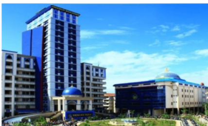
Figure 2 Iqra' Tower Building Unismuh Makassar

Iqra' Tower is a tower with a geographical location with latitude -5^{\circ} 11'49.20 South Latitude and Longitude 119^{\circ}26'49.20'' East Longitude with a height of 70.9 M above sea level which consists of 19 floors. The place for ruyatulhilar is on the 18th floor, which can be seen in the image below.