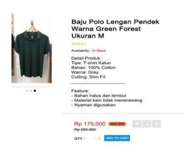
Figure 4. product ordering

This is a page for ordering products by buyers/customers. Buyer data, product data, and the quantity to be collected/purchased are required when ordering this product. The transaction results are then stored in the system to be processed through payment confirmation services and fill in the delivery status of goods/products.