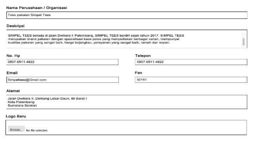
Figure 2. Product input page

This is a service for recording products and goods produced by small and medium businesses. This page is given to small and medium business managers to enter data.