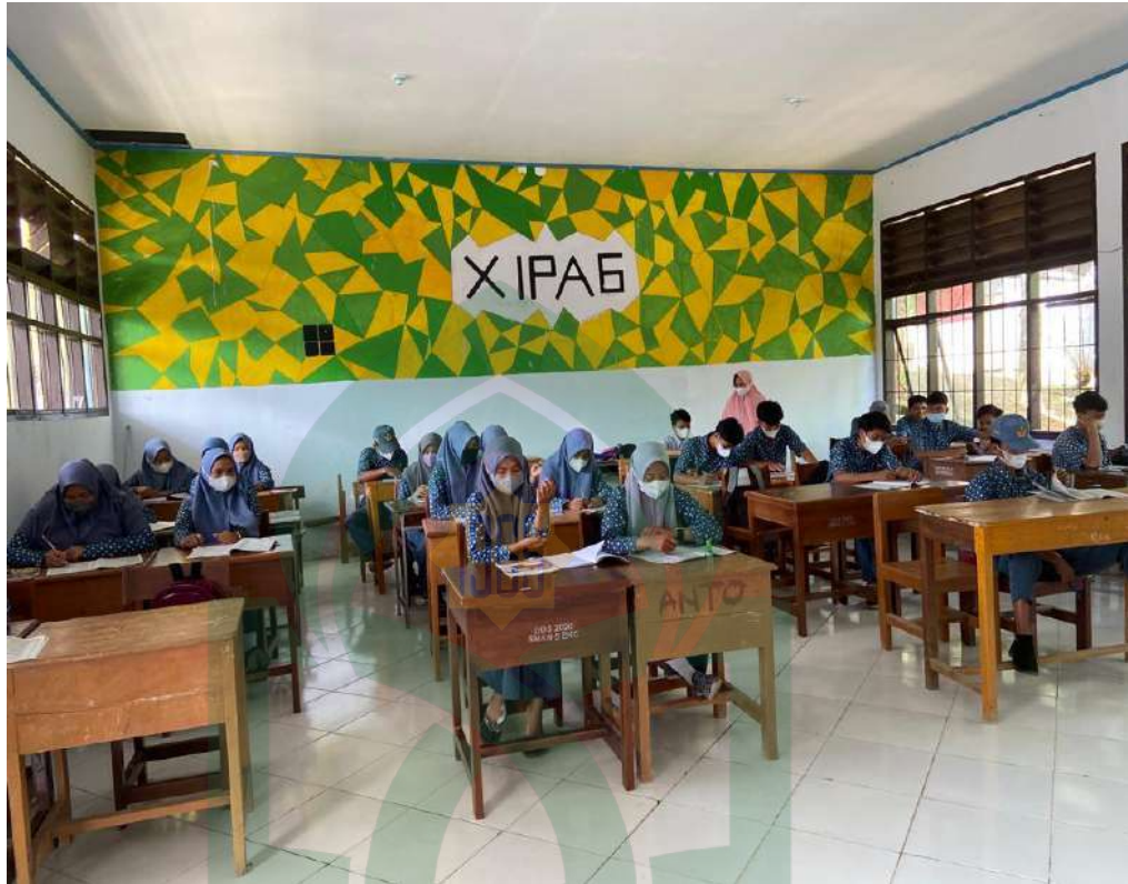
✚ The 1 st grade students of SMA Negeri 5 Enrekang