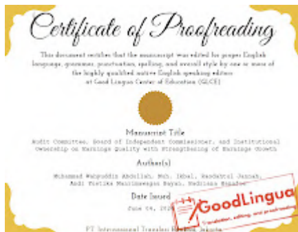
Certificate_of_Proofreading Muhammad Wahyuddin ABDULLAH etc.jpg 418K