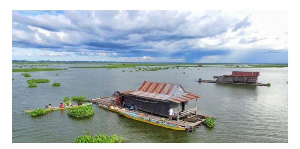
Figure 2 . Preserving the Environment of Tempe Lake

23 Pebruary 2024) This is an inseparable part of environmental education that teaches how it is necessary for humans to always maintain a constructive relationship with the environment by using it for the needs of life and not destroying it. In addition, the sennusennureng mappanre ise wanua also contains environmental education because in it there is togetherness to help each other and not fight for a target without caring about the rights of people in their social environment. This togetherness is important in relation to environmental education because basically those who are aware that their existence in a complex social system always has implications with the people around them, they will always strive to maintain their behavior, including by preserving the environment and not damaging it. Those who are willing to set aside part of the property they earn to entertain people in their social environment can be said to be people who have the spaciousness of chest and breadth of heart not to arbitrarily exploit the surrounding natural environment that brings destructive effects to those around them. The existence of the meaning of sennu-sennureng mappanre ise wanua from just a form of gratitude to the Creator for the abundance of grace obtained into a meaning with a dimension of critical social awareness in preserving the environment and not damaging it is part of the transformation of the sacred to profane.