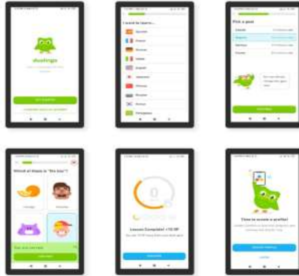
Figures 2.1 Steps of Duolingo Application

The user interfaces of Duolingo classroom. The (1) part shows the member of the Duolingo classroom, their activities, and their gained experience. We can also manage the classroom member by inviting more students or remove them. The (2) part is used for the teacher to give the assignment to the students. They can arrange the deadline and the material which is going to be tested. The (3) part is the English Curriculum. It shows the whole material that is available in Duolingo. The materials are divided into three levels, beginner skills, intermediate skills, and advance skill. The students cannot access the higher level if they have not done the lower skill or without teachers' permission. The teacher can review it first to find the suitable material for the learning before giving it to the students in the class activities (4). The (5) part consists of classroom setting. There are a set up