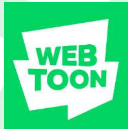
Figure 2.1 LINE Webtoon Logo

Webtoon is a word that combines web and cartoon (comic). LINE Webtoon refer to Korean webcomics or cartoons published online. This website in South Korea, Daum, launched webtoon service in 2003, and in 2004, it was followed by Naver. These services regularly release free webtoons. As digital comics became more popular, paper comics (manhwa) publications declined. The amount of works published on webtoons has reached the same amount as the amount published offline. LINE Webtoon or online comics are a popular form of entertainment for all ages. They enjoy reading with graphics and colors that capture their interest.