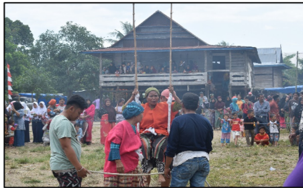
Figure 3. The Ascending Descendant to the Swing

After the mappano ceremony, the next phase is mappammula maddoa (starting the swing). In this stage, the first person to ride the swing is a descendant of Pallipa Pute'e, accompanied by the sound of drums played in specific rhythms (see Figure 3, 4 & 5).