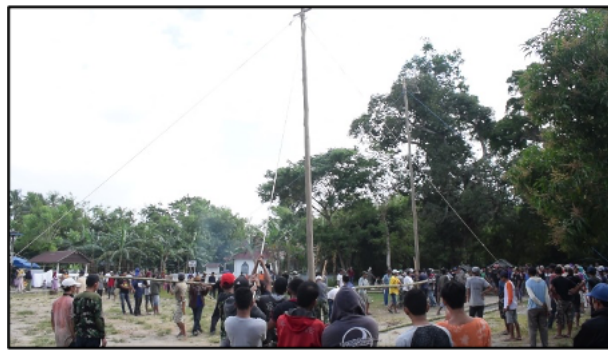
Figure 2. The Establishment of the doa (swing)

After the village head recites the prayer ( sannu-sannungan ) and all preparations for the swing are complete (such as ropes, rattan, and other materials), the gathered community members collaboratively ( massiddi ') begin to raise and erect the swing posts. While waiting for the swing to be tied and assembled securely to bear the weight, other community members prepare the lesung , which will be used in the mappadendang ceremony.