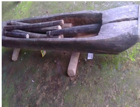
Figure 1. Lesung for the mappadendang (rhythmic singings)

Once the date is set, permits are secured, and preparations are in place, the next step involves the community completing the necessary arrangements for the event. For instance, in terms of attire, the community dresses in traditional clothing such as baju bodo (traditional shirt), sarung (cloth wrap), jas tutup (traditional jacket), and others. Other equipment includes alu panjang , and lesung (see figure 1.) used for mappadendang , and gendang used for maggandrang (local rhythmic percussions).