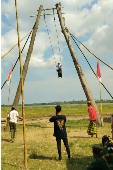
Figure 5. The High Swing of Gratitude See Video representation ( Link )