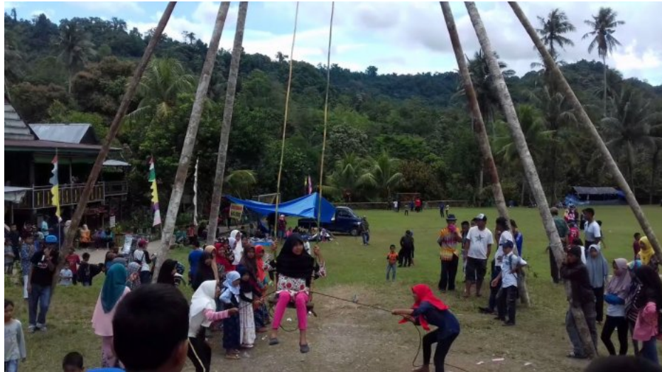
Figure 4. The Swing as Grateful Expression