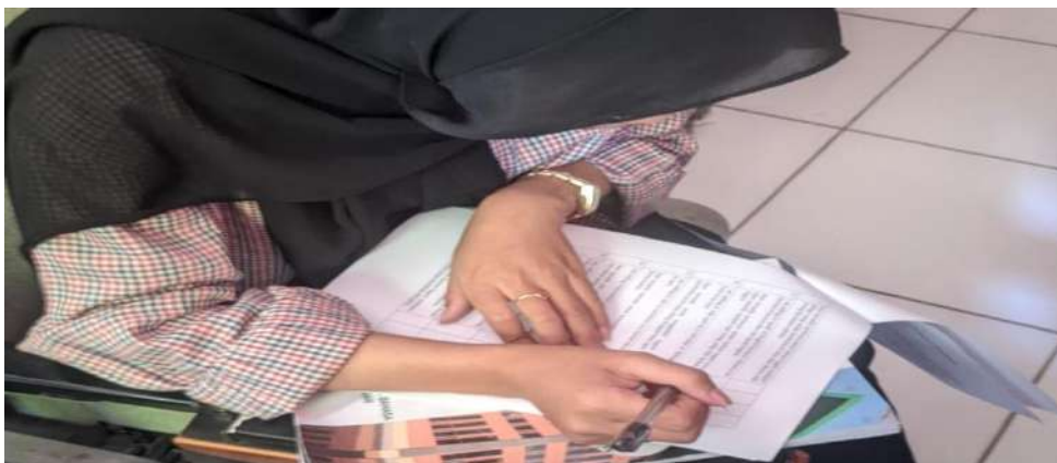
Documentation of questionnaire data collection