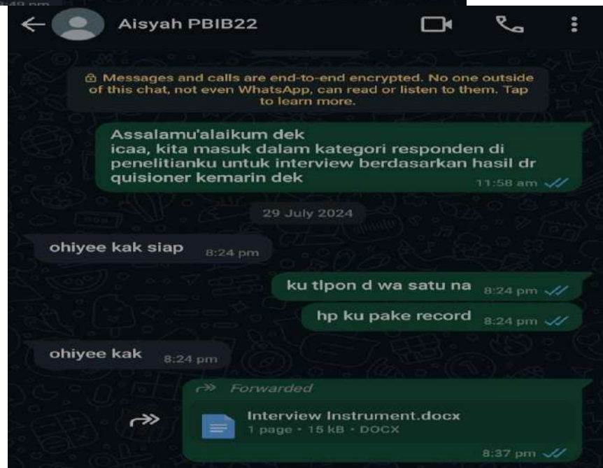
Documentation of interview data collection