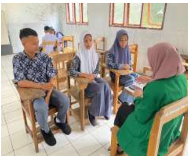
Interview S4, S5 and S6 on 29 may 2024 at SMA Islam Hizbul wathan