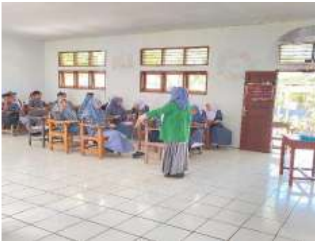
Selecting respondents and conducting the first interview on 22 May 2024 at SMA Islam Hizbul wathan