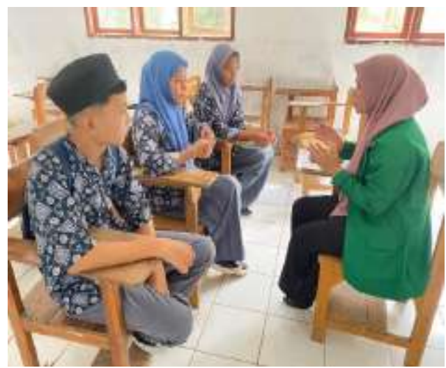
Interview S7, S8 and S9 on 29 may 2024 at SMA Islam Hizbul wathan