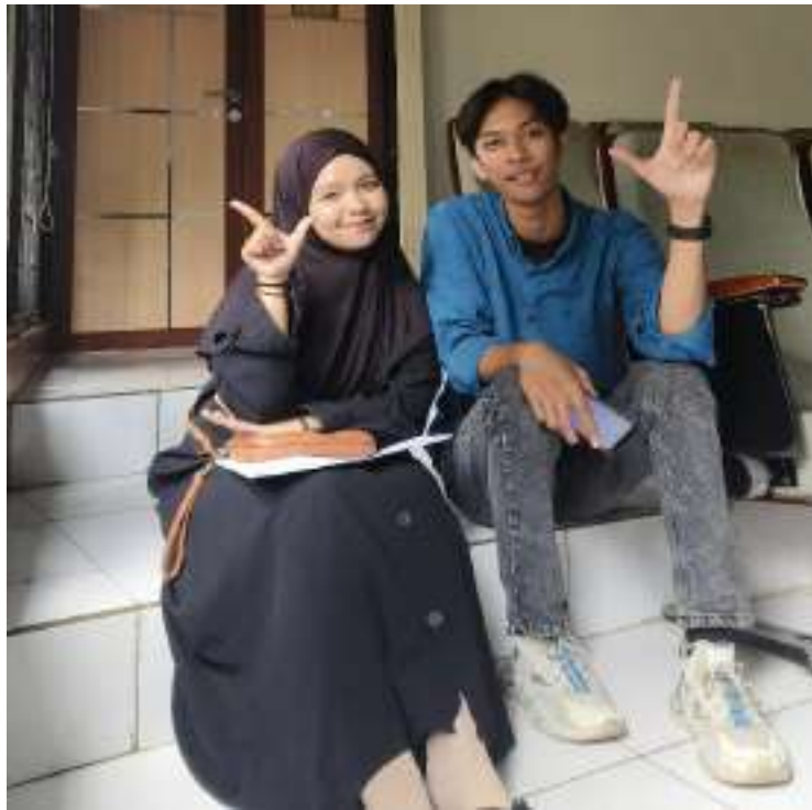
Figure 4. Documentation of the interview process with respondents (FA) on Monday, June 3 rd , 2024 at 12.38 PM in the East LT room, Faculty of Tarbiyah and Teacher Training