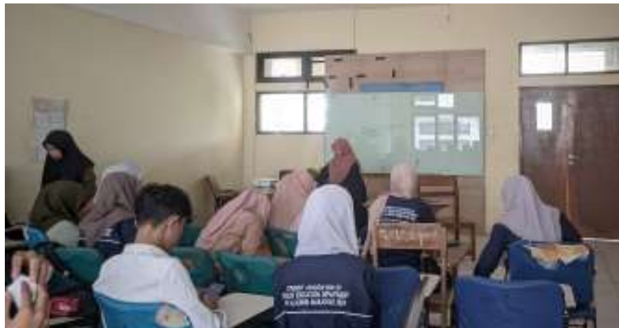
Figure 1. asked students to fill out a questionnaire which was carried out on Wednesday, May 22 nd , 2024 at 3.30 PM which took place in class T3.20, Faculty of Tarbiyah and Teacher Training