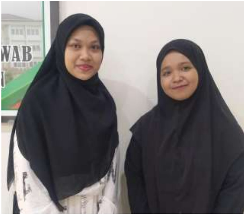
Figure 7. Documentation of the interview process with the respondent (NM) on Monday, June 10 th , 2024 at 12.18 PM in front of the Faculty of Tarbiyah and Teacher Training