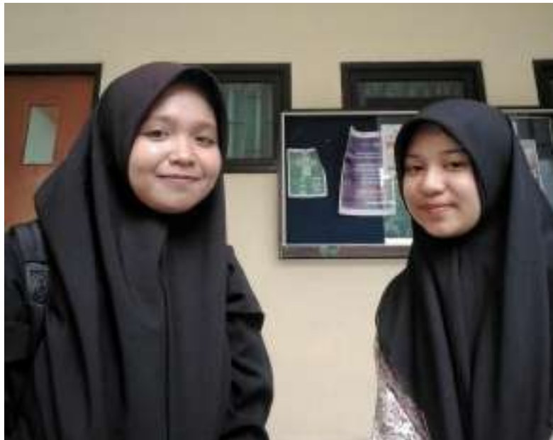
Figure 6. Documentation of the interview process with respondents (NA) on Monday, June 3 th 2024 at 1.33 PM in the East LT room, Faculty of Tarbiyah and Teacher Training