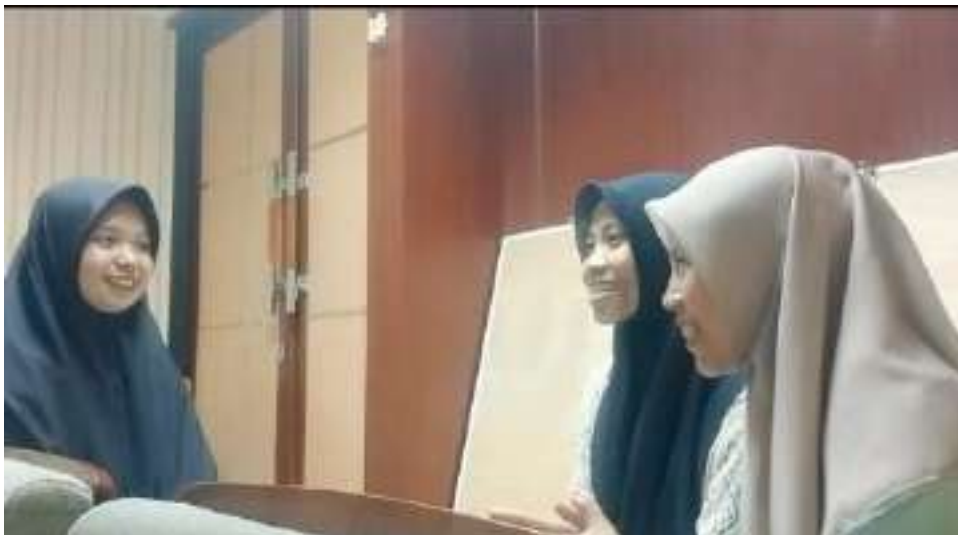
Figure 3. Documentation of the interview process with respondents (MM & NP) on Friday, May 31 st . 2024 at 11.47 AM in the East LT class, Faculty of Tarbiyah and Teacher Training