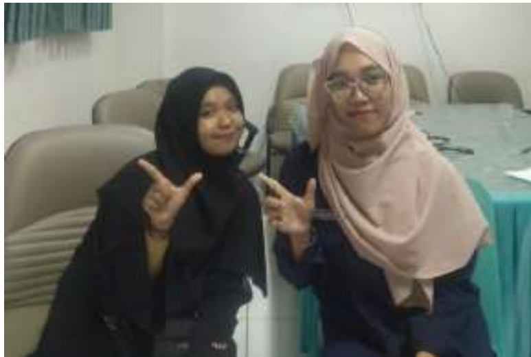
Figure 2. Documentation of the interview process with respondents (GPR) on Wednesday, May 29 th 2024 at 11.50 AM in class T3.20, Faculty of Tarbiyah and Teacher Training