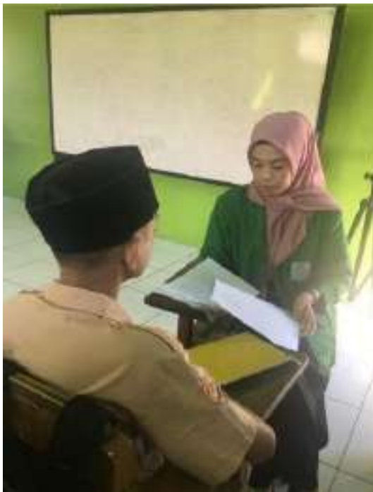
The researcher interviewed student with the initial MPRKR