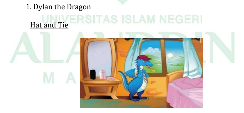
He put on his baseball cap and school tie and flew past the valleys and mountains until he reached the little village of Falkrik.