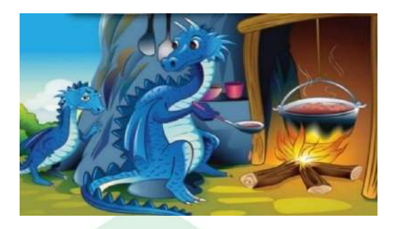
When he was hungry he would go home to his cave where Mummy dragon would have hot soup ready for his dinner.

"Wash your wings and get ready for tea. I've made your favourite today, darling... pea and toad soup" said mummy dragon. Dylan sighed, "Ehhh...Thank you mum." he said sadly.