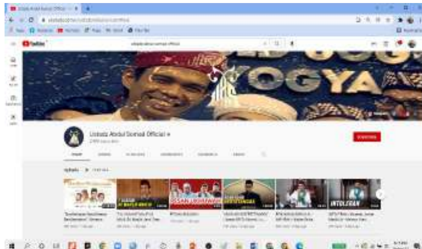
Figure 3: Ustadz Abdul Somad Official YouTube ( https://www.YouTube.com/c/UstadzAbdulSomadOfficial )

lil alamin ; self-reflection; strengthen ukhuwah in congregation; don't die before building a mosque; 7 reasons to the maulid assembly; Neighboring etiquette; 3 Benefits to the Mosque; and unite the people towards pleasure. Most of the themes presented are related to the reality of the life of Muslims today. Viewers: 191,181,740 times.