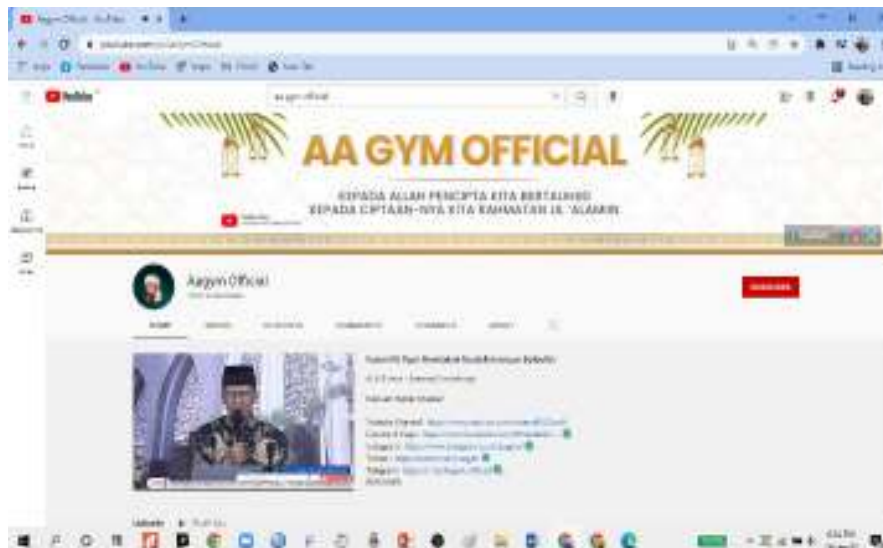
Figure 1: Aa Gym Official YouTube ( https://www.youtube.com/c/AaGymOfficial )

training the heart to be more confident in Allah ta'ala; and God who has justice majesty. Paying attention to these themes, Aa Gym focuses more on its da'wah on monotheism study material to strengthen faith and piety to Allah. The Aa Gym Official channel joined on February 29, 2016 and has been watched 71,566,109 times.