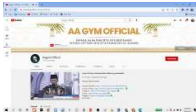
Figure 1. Channel Aa Gym Official

to these themes, Aa Gym focuses more on its da'wah on monotheism study material to strengthen faith and piety to Allah. The Aa Gym Official channel joined on February 29, 2016 and has been watched 71,566,109 times.