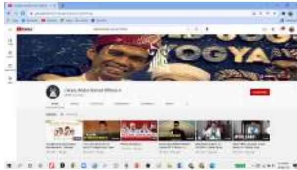
Figure 3. Ustadz Abdul Somad Official Channel (www.youtube.com, 2022)

Furthermore, regarding audience acceptance of online da'wah on Youtube social media, it was found that the informants were divided into two, namely: (1) dominant position (agree) and (2) negotiating position (considering). Meanwhile, the position of opposition (rejecting) was not found in this study. The dominant position means that the audience accepts and approves the preaching program; negotiation means that the audience considers the da'wah program, criticizes, does not immediately accept or reject the contents of the show, thinks carefully before they accept it; and opposition means that the audience rejects and disapproves of preaching broadcasts on Youtube.