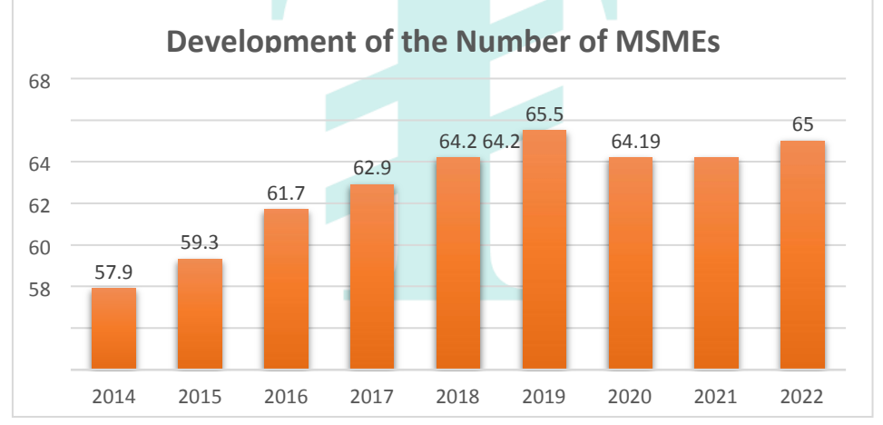
Fig. 1 Development of Number of MSMEs Source : Department of Cooperatives and Small-Medium Enterprises

The occurrence of competition in the business world is inevitable, considering the large number of business actors as is currently happening. In Indonesia, the number of MSMEs has increased significantly, as seen from data from the Ministry of Cooperatives and SMEs, the number of MSMEs in Indonesia in 2021 was 64.19 million with participation in gross domestic product (GDP) of 61.97% or worth IDR 8.6 trillion. Data from the Ministry of Cooperatives and SMEs recorded that as of February 2022, there were already 17.26 million MSME actors who had entered the digital ecosystem and the growth rate reached 100% faster than the previous year. From the statement above, it can be clearly seen in