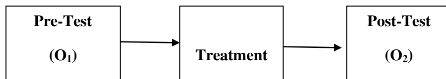
Figure 1. Research Design

The design of this research was quasi experimental research. According to Arikunto (2010) Quasi-experimental research designs, like experimental design, test casual hypotheses. In both experimental and quasi experimental designs, the program is viewed as an ‘intervention’ in which a treatment-comprising the elements of program being evaluated is tested for how well it achieves its objectives, as measured by a pre-specified set of indicators.