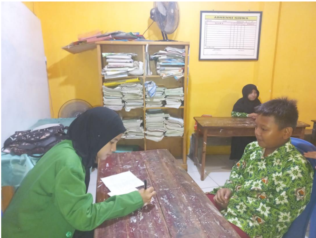
(Abdul Jabbar) (9)