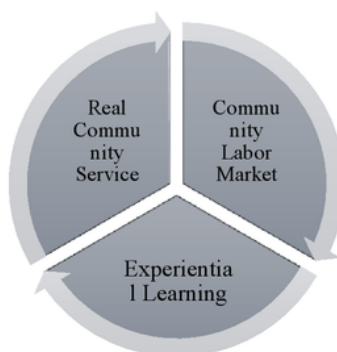
Figure 2. Ways of Community Engagement Integration

The integration of community engagement into teaching, learning, and students experience was done through three important ways; involving students to the real community practice, providing community labour market, and application of experiential learning. The relationship of this ways are described through the following figure.