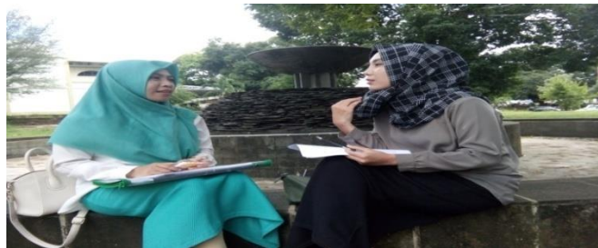
Figure 4.1 Interviewing participants about kinds of slang language She used in daily conversation

Based on the interview has been conducted by the researcher, the data showed that whether male and female used slang language in their daily conversation. Most of the interviewee felt enjoy to speak slang language eventhough they did not know what kind of slang language they used.