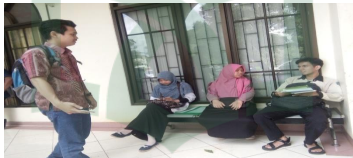
Figure 4.2. The four students talked about the thesis problem.

The first observation was done on Thursday, 9 th February 2017. In first observation, there were four students talked about thesis problem faced by students in the corridor of first level Tarbiyah and Teaching Science Faculty building (see figure 4.2).