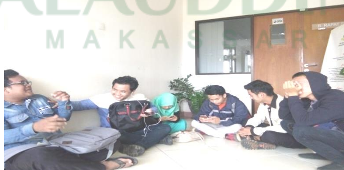
Figure 4.4 The students talked about Community Service Learning announcement.

The third observation was done on Wednesday, 15 th February 2017. In third observation, there were six students gathered in the second level of Tarbiyah and Teaching Science Faculty building (See figure 4.4)