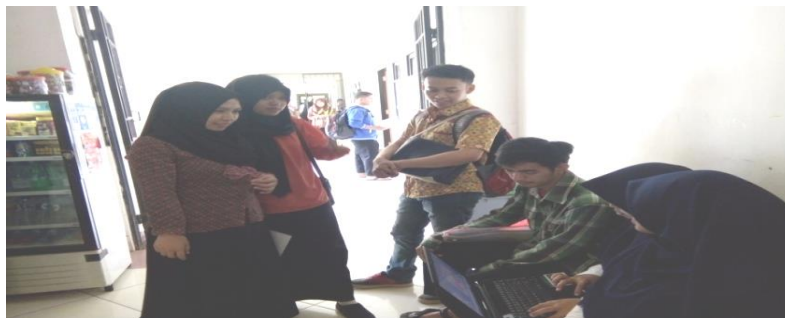
Figure 4.3 The students talked about the problem faced in finding some books as references for the thesis

The second observation was done on Monday, 13 rd February 2017. In second observation, there were six students talked about casual problem in first level of Tarbiyah and Teaching Science Faculty building (See Figure 4.3). The six students were two males and four female even two of them did not participate in this observation section. It meant only four students being the participant. They were Kamboja, Tulip, Violet, Anggrek. All of participants used disguised name to keep their privacy.