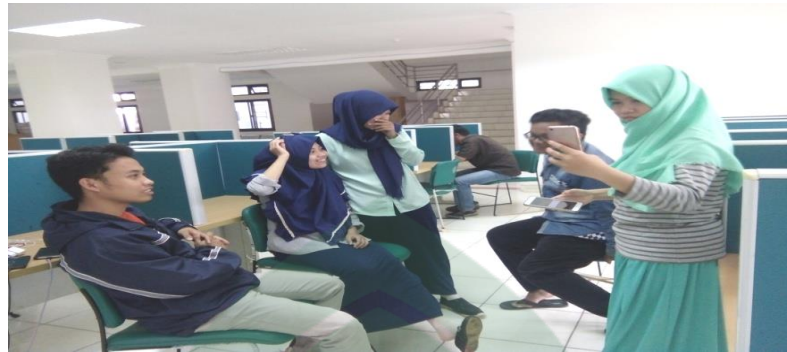
Figure 4.5 the students talked about casual problem related to the way to fill the KRS.

Alauddin Makassar. There were three female and two male students which observed by the researcher (See figure 4.5).