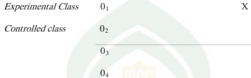
Figure 3.1. Research Design

researcher compared pretest and posttest score of both classes that can be presented as follow: