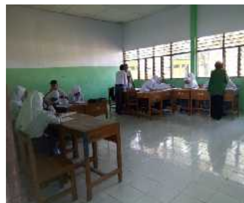
The researcher was controlling the process of the research