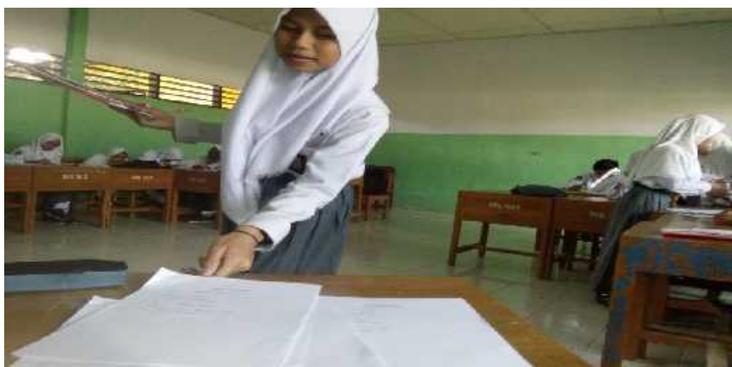
She was collecting the questionnaire.