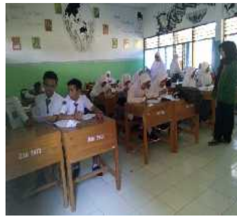
They were answering the questionnaire seriously