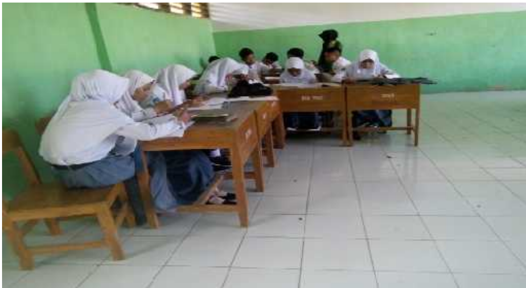
The researcher was explaining to the respondent what doesn't he understand