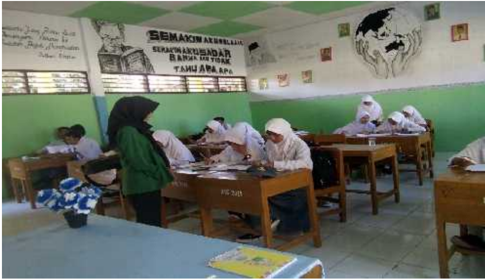
The respondents were doing the paper test seriously