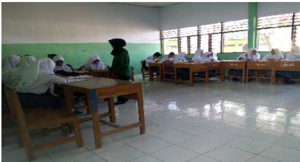
The researcher was explaining how to do the questionnaire