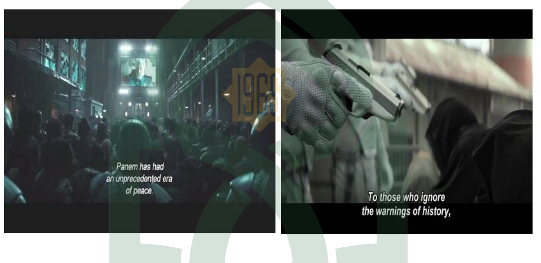
Datum 7: Unprecedented Era

the game seems interesting because the tributes have to kill each other to get the foods and drinks. (Picture 4.9, 1:53:45 - 1:54:04 and Picture 4.10, 1:56:19 on Hunger Games)