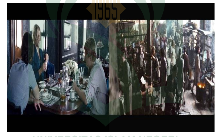
(Picture 4.2 26:42, on Hunger Games and picture 4.3 14:3, on Catching Fire)