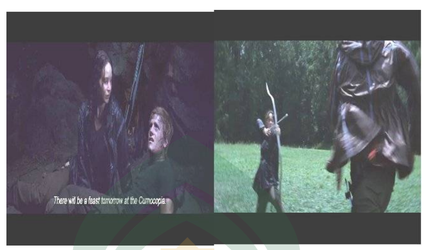
(Picture 4.9, 1:53:45-1:54:04 and picture 4.0. 1:56:19 on Hunger Games)