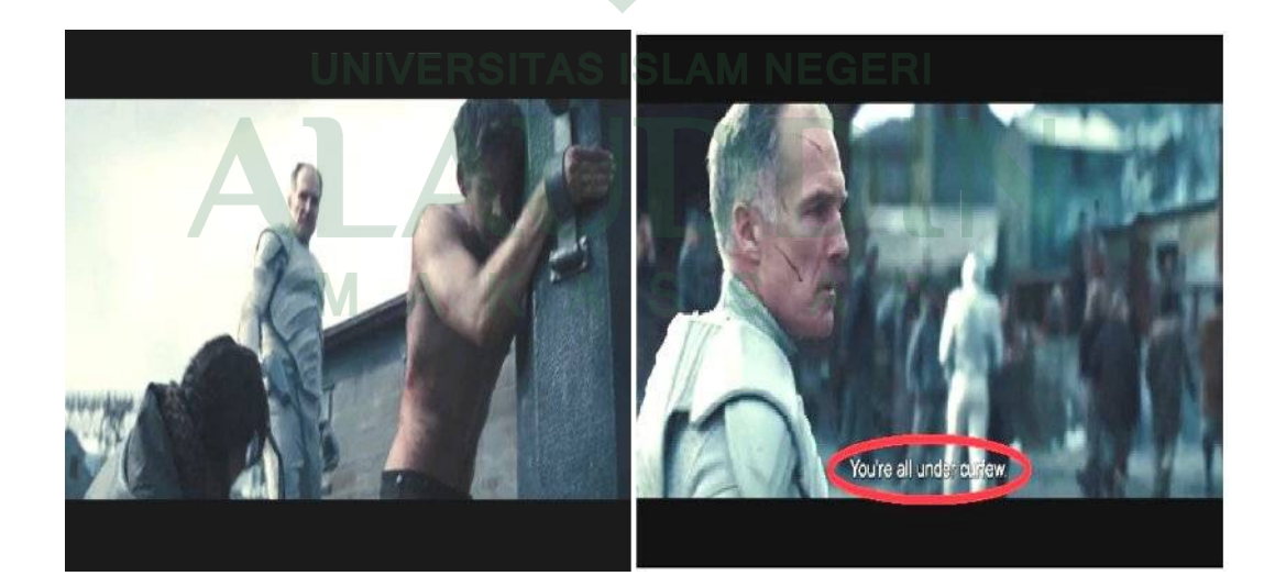
Datum 10: Capitol Oppresses Residents