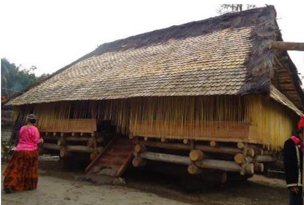
Fig.1. Lobo Architecture