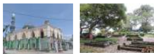
Figure 5: Awaluddin Mosque and The Tombs of Tallo King's

The large tomb has an access to it, many people bring offerings to it. Furthermore it also becomes a tourism object in this Moslem Tallo village, and many local residents from outside of the area visit it as well.