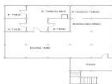
Figure 3: Street condition & The Plan of Bugis-Makassar Custom House

From the results of the survey conducted, there are 3 bedroom's king beds with their ornaments and striking colors, namely red and yellow. There is also a floral