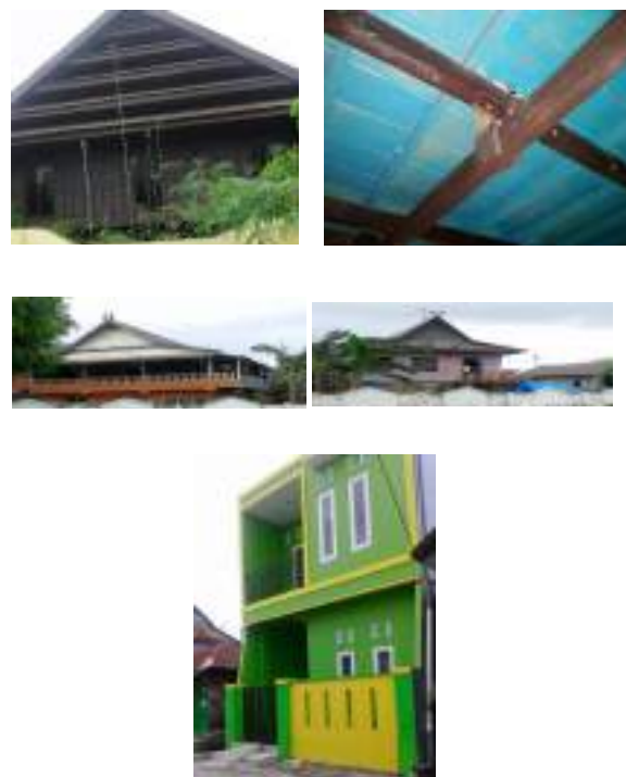
Figure 4: In habitat's house and Modern House in Tallo Village

population are fond of the custom houses of their called stilt houses.